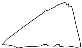
Section C - C'