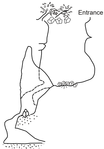
Extended section AA'