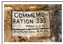
Commemoration 333 Plan