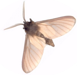
Apsia canescens (Woolly Worm moth)